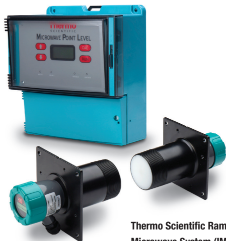
Thermo Scientific Ramsey Integral Microwave System (IMS-2) Sender, Receiver and Amplifier/Control